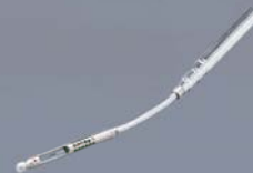
Telescopic, articulating probe