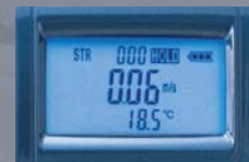
LCD display with bright backlight