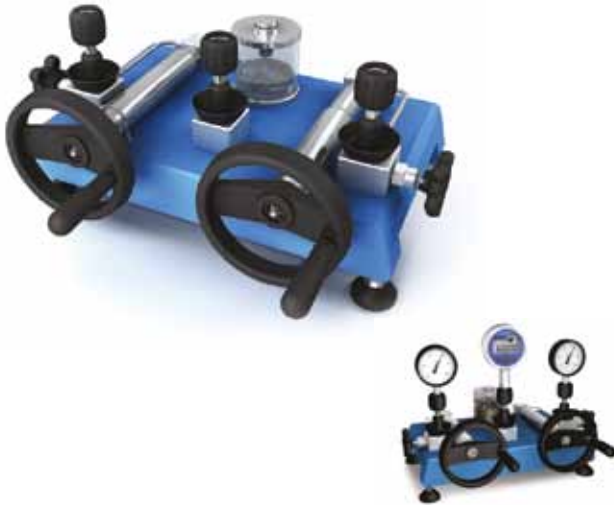
-12.5 psi to 15,000 psi