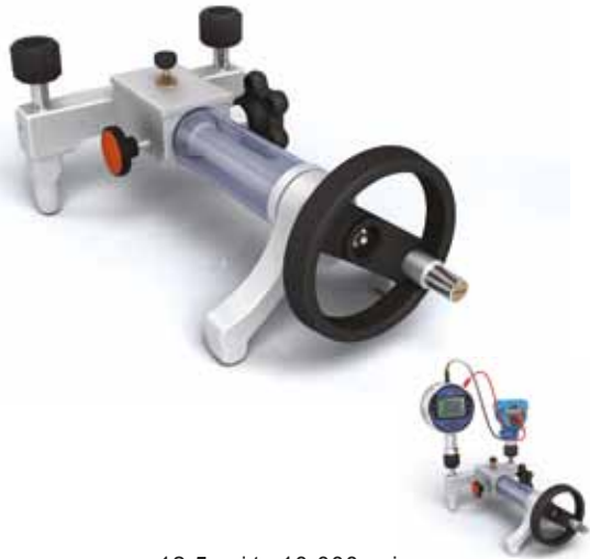
-12.5 psi to 10,000 psi